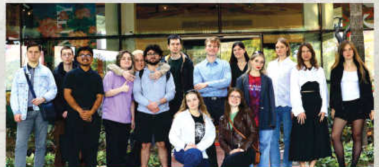
International Students from Russia, Canada & Europe