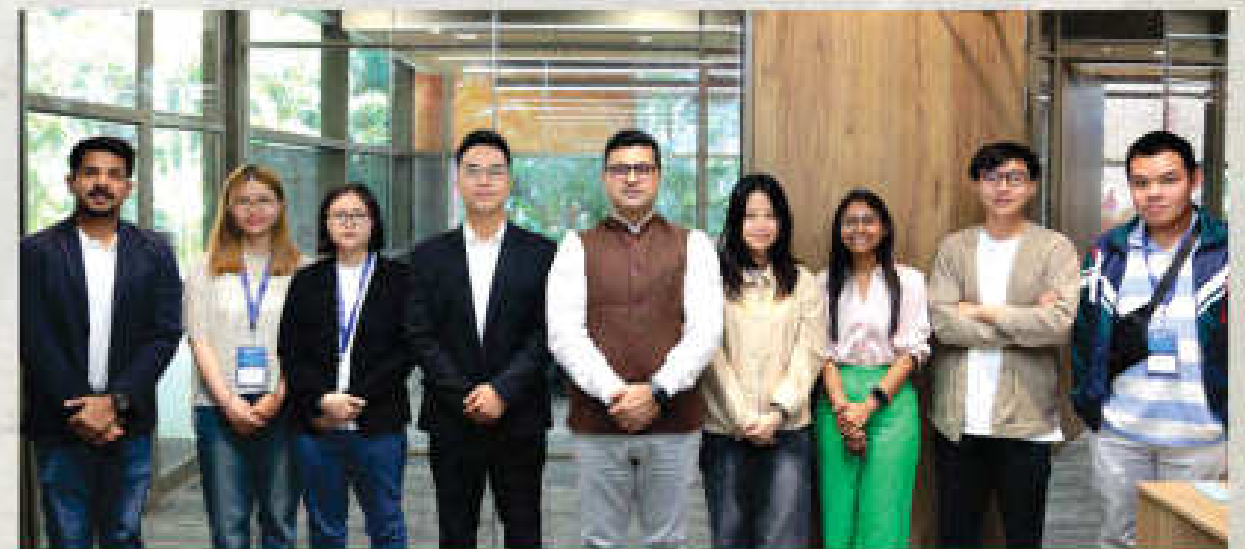
University of Economics & Law, Vietnam