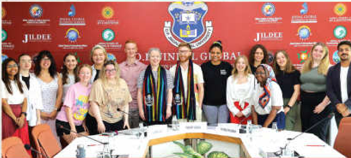
University of York & University of Hull, UK