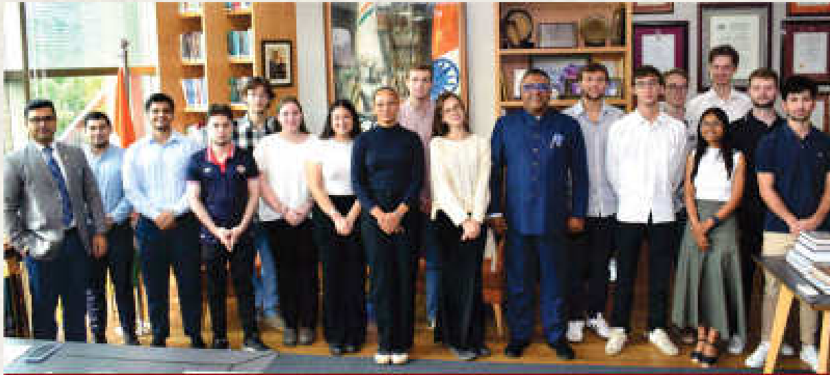
International Students from European Countries