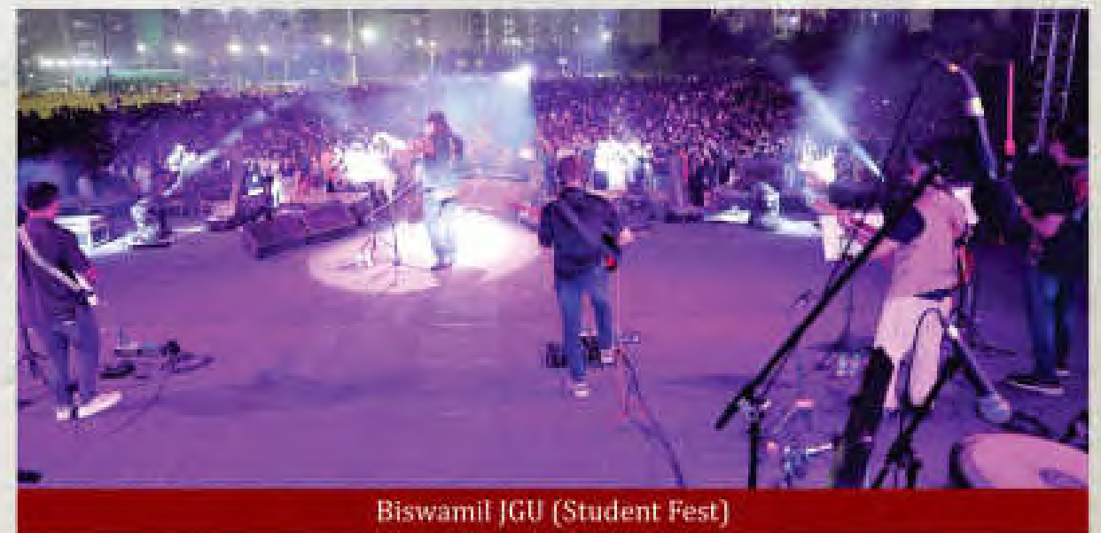
Biswamil JGU (Student Fest)