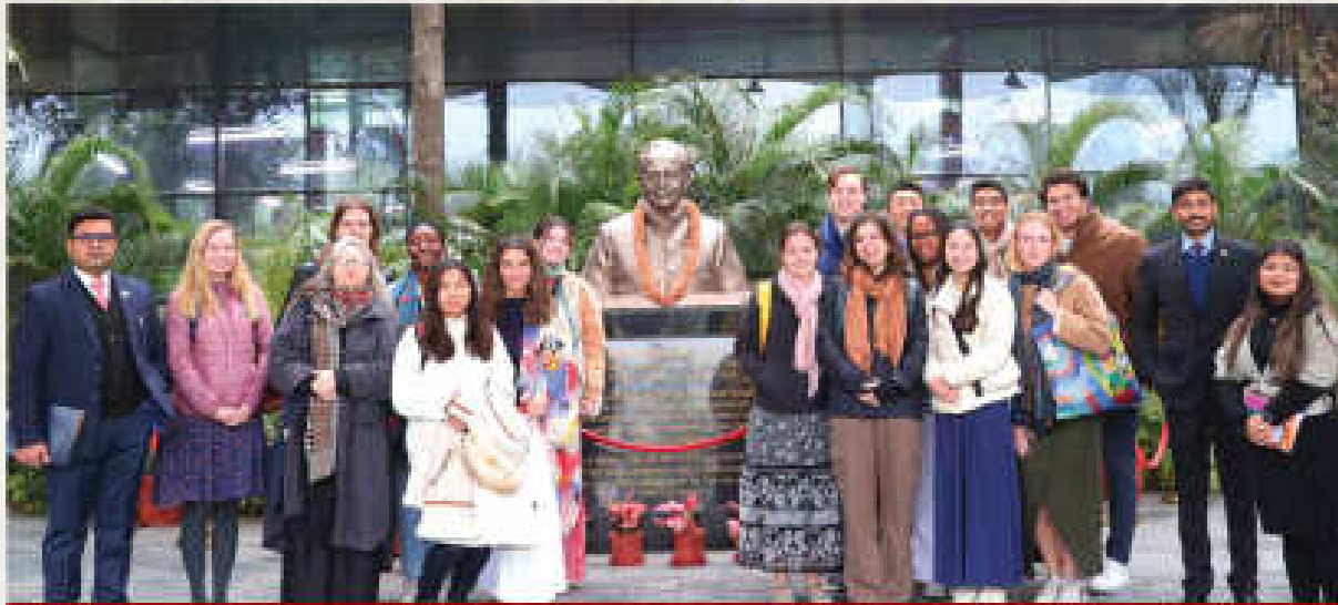
University of Virginia, USA