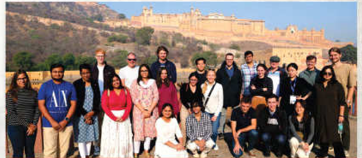
International Students from University of Sydney, Australia