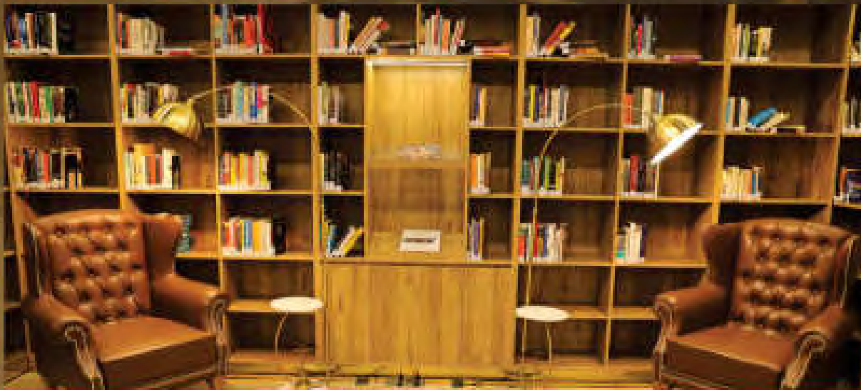
Manthan - Reading Lounge