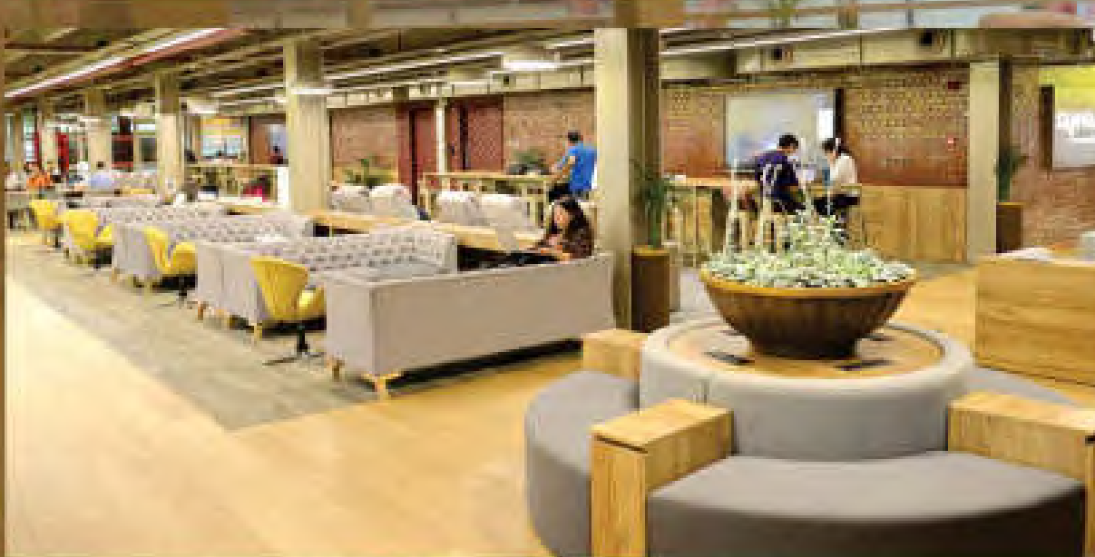
Samvaad - Faculty Lounge