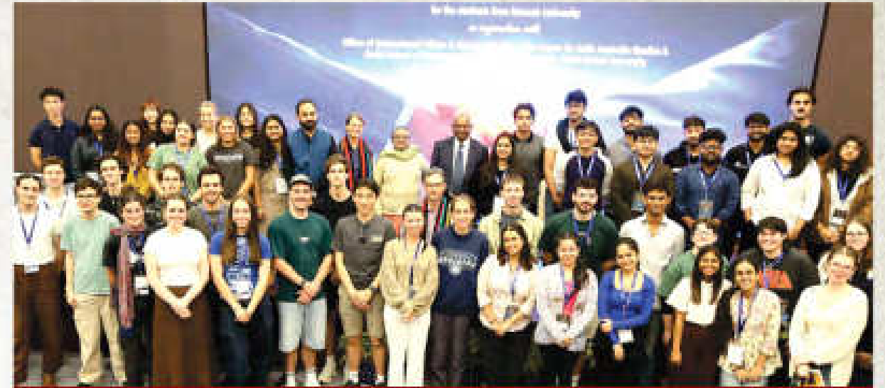
International Students from Australia & Europe