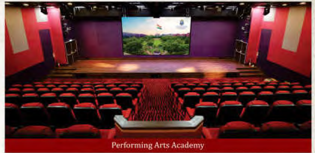
Performing Arts Academy