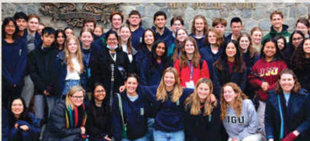
Monash University, Australia