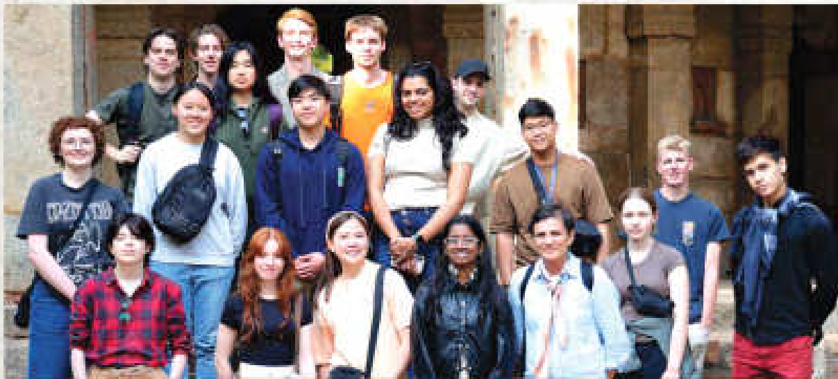
International Students from USA, Australia & Europe