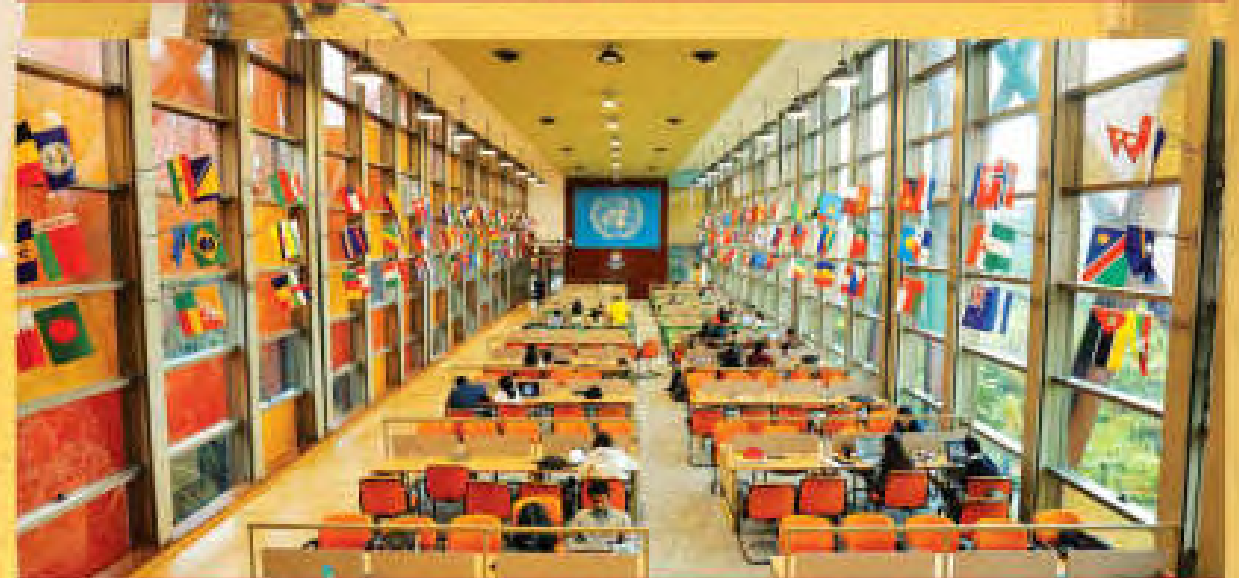
Global Library Room