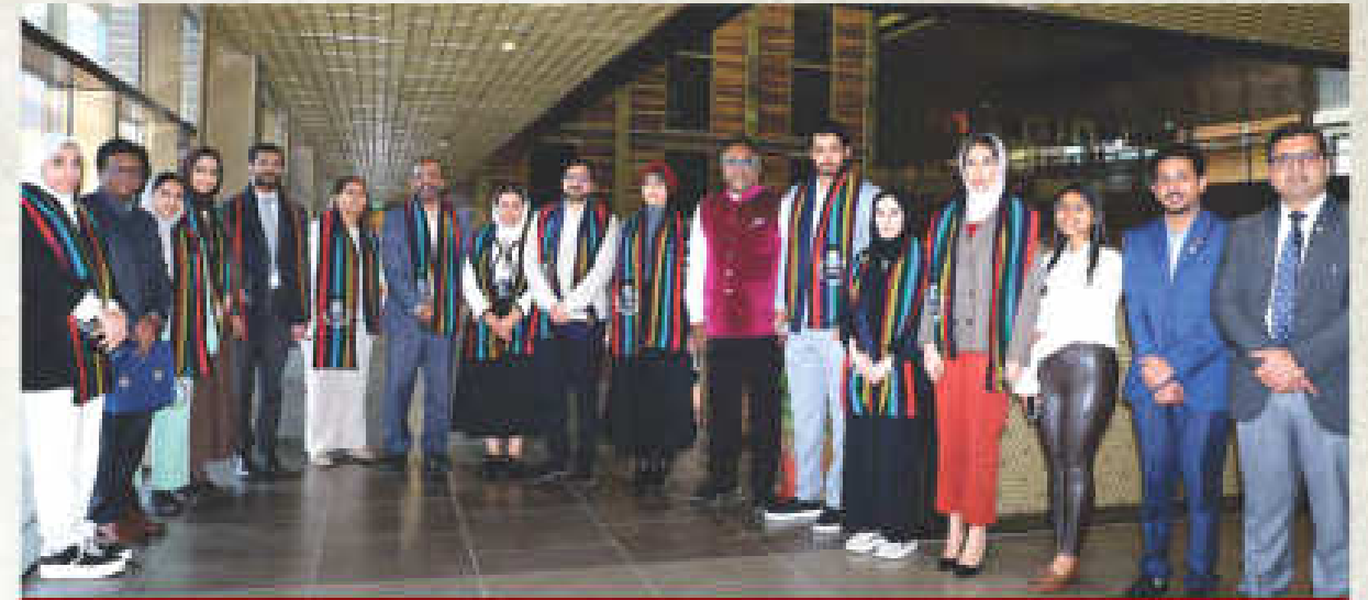
Diplomat Trainees-Anwar Gargash Diplomatic Academy, UAE