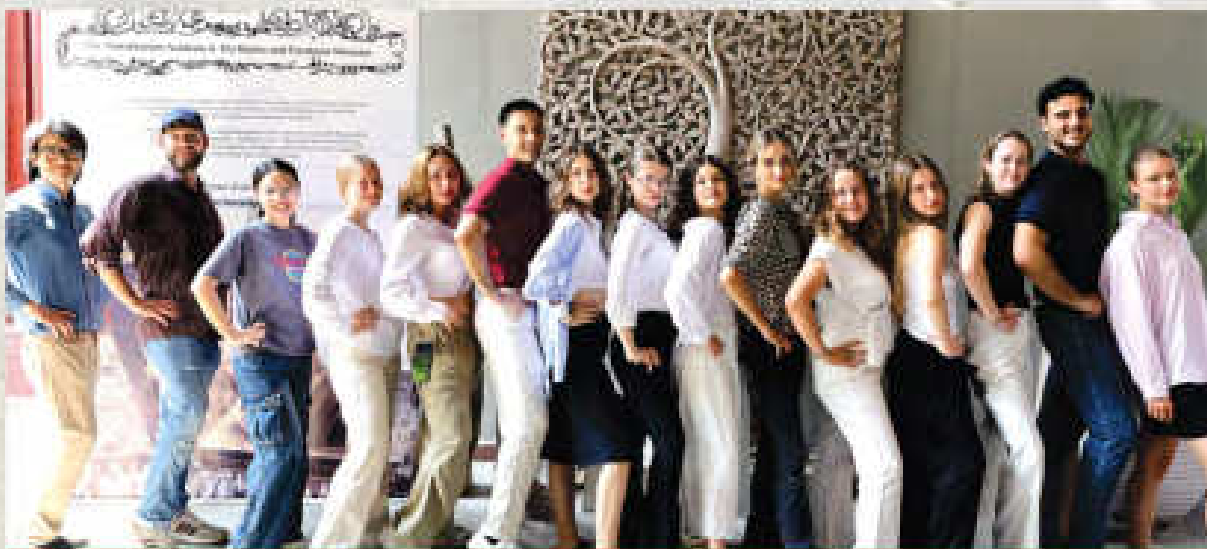
International Students from Australia, South East Asia, Europe & Russia