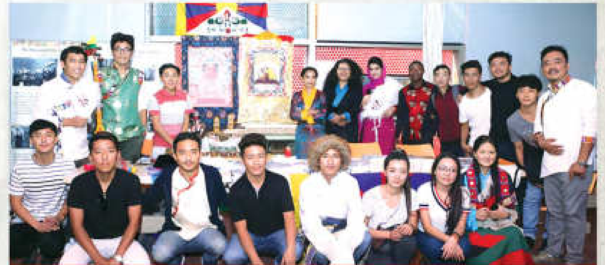
National Chengchi University, Taiwan